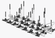
(3) A 621