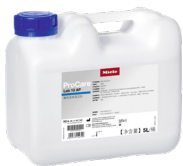
ProCare Lab 10AP