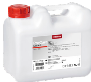
ProCare Lab 30C