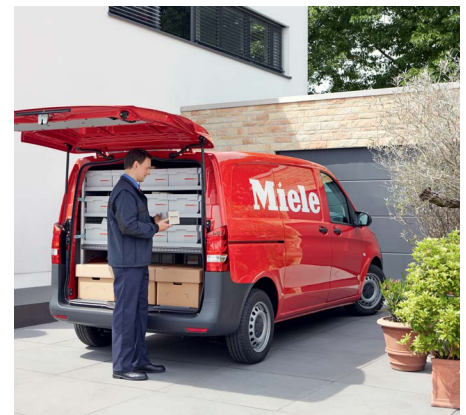
Dedicated Service: All machines come with dealer supplied installation and in-service training. Preventative maintenance programs are also offered through Miele Service.