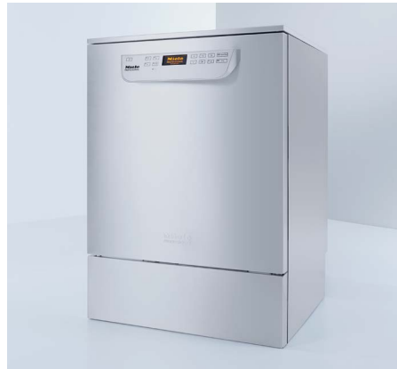
Competent Machinery: 24" wide stainless steel machine with three rotating multi-jet spray arms.

Miele offers all of the products necessary for your machine; accessories, detergents and unmatched service and training.