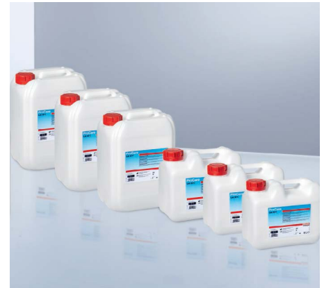
Cleaning Essentials: ProCare Dent cleaning agents ensure best cleaning results for your dental instruments when used with the Miele washer-disinfector.

For more information or to view our PG 8581 Dental washer-disinfector, accessories and dental detergent products or to download our dental product brochures, please visit our website at www.miele-pro.com