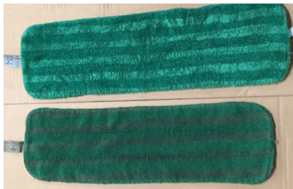
Top: After 9 months washed with Miele. Bottom: After 2 Weeks, washed in a competitor washer.

Miele washers and dryers reduce shrinkage in mops- saving money by eliminating the need for costly, industry-specific mop head replacements.