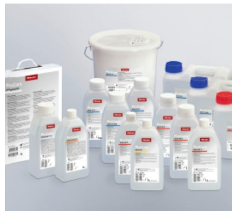
Cleaning Essentials: ProCare Dent cleaning agents ensure best cleaning results for your dental instruments when used with the Miele washer-disinfector.

For more information or to view our PG 8581 Dental washer-disinfector, accessories and dental detergent products or to download our dental product brochures, please visit our website at www.miele-pro.com