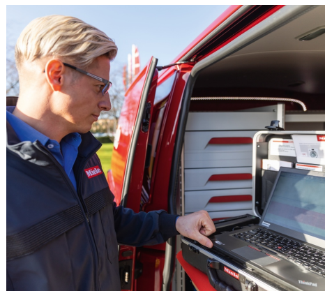
Dedicated Service: All machines come with dealer supplied installation and in-service training. Preventative maintenance programs are also offered through Miele Service.