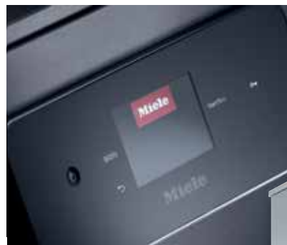
M Touch Flex