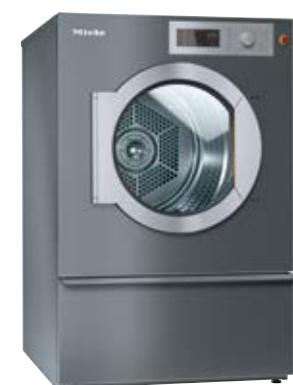
Benchmark dryer PDR 914 COP

Impressive with M Touch Pro Plus, automatic door lock, fast programmes, 12 kg capacity and the patented honeycomb drum.