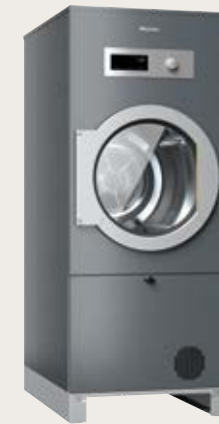
SlimLine dryer PDR511 ROP SL HP

Simply scan the QR code and discover the right machines from Miele Professional. www.miele.ie/pro/self-service-products