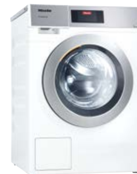
Little Giants washing machine PWM 907 Self Service

Optimised for the self-service area, space-saving (711 mm) and easy to transport. Fast drying thanks to diagonal air flow. 11 kg load size.