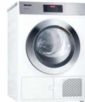
Little Giants dryer PDR 908 HP

Space-saving and perfect for self-service areas with specialised wash programmes. Compact, 7 kg load size and tested for intensive use.