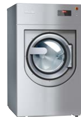
Benchmark washing machine PWM912

Energy-efficient heat pump dryer with short running times. Compact, 8 kg load size and tested for intensive use.