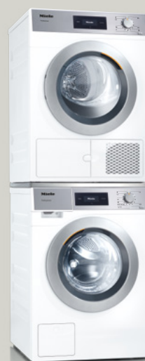
Miele Little Giant 6-8kg washers and dryers