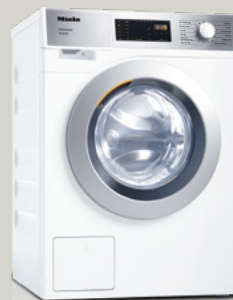
Miele Little Giant 6-8kg PWM 507 Hygiene washers