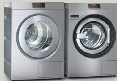
Miele Benchmark 9-11kg washers and dryers