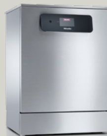
Miele Masterline fresh water dishwashers