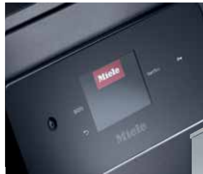
M Touch Flex