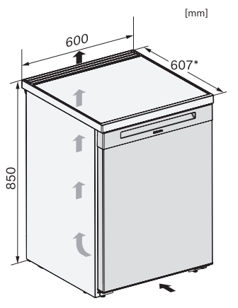
K4003D ws, K4002D ws, F4001D ws, F4001C ws, FN4002D ws, installation sketch (*footnote) (installation drawings)

*To achieve the declared energy consumption, the spacers supplied with the unit must be used. This increases the depth of the unit by approx. 35 mm. The unit is fully functional without the use of the spacers, but has a slightly higher energy consumption.